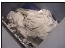
POWERFUL INTEGRATED SHREDDER