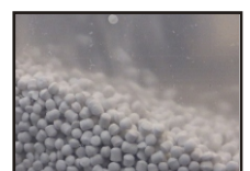
1ST GRADE QUALITY PELLETS