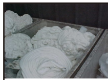
PURGINGS & START-UP SCRAP