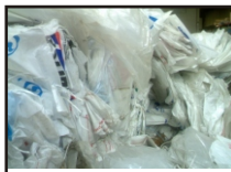
BAGS, SACKS & PUNCH-OUTS