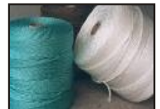
FIBRES, TAPES & ROPES