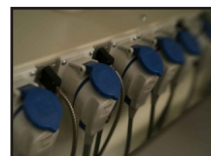
QUICK & EASY OPERATOR MAINTENANCE