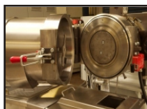
EASY CLEAN PELLETISING