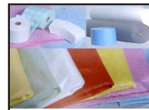
FABRICS & NON WOVENS