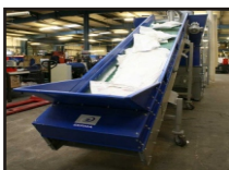
MATERIAL HANDLING OPTIONS