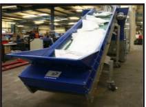
MATERIAL HANDLING OPTIONS