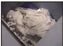
POWERFUL INTEGRATED SHREDDER